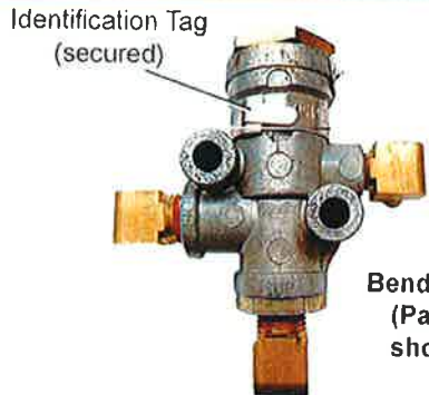
Bendix® TR-3™ Valve (Part No. 101450 shown on valve)

To verify that the Bendix® TR-3™ valve (P/N 101450 displayed on the valve) has been replaced per the recall campaign, look for the presence of a green cable tie secured to the valve body. No further action is required.