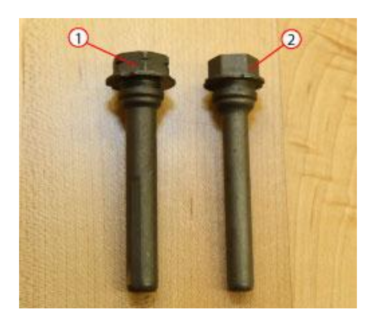
Fig. 1 Caliper Slide Pin Comparison