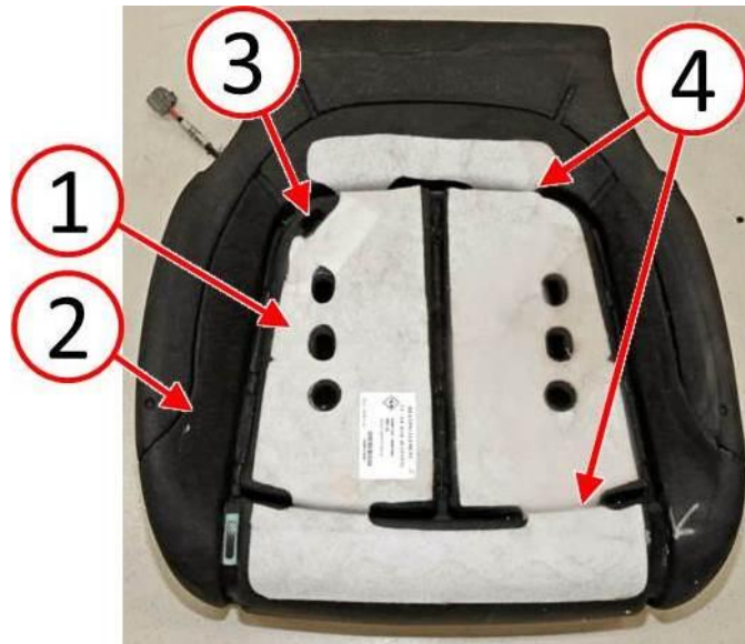
Fig. 2 Install New Heater Pad To Foam Cushion

NOTE: Ensure the heated seat pad (1) is tucked fully into the seat foam cushion channels (4) at front and back of the foam cushion and the heater pad lays flat on the foam cushion without wrinkles ( Fig. 2 ).