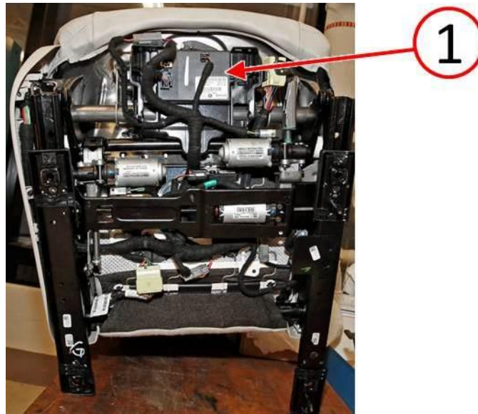
Fig. 4 CSWM Location Under Passenger Side Seat