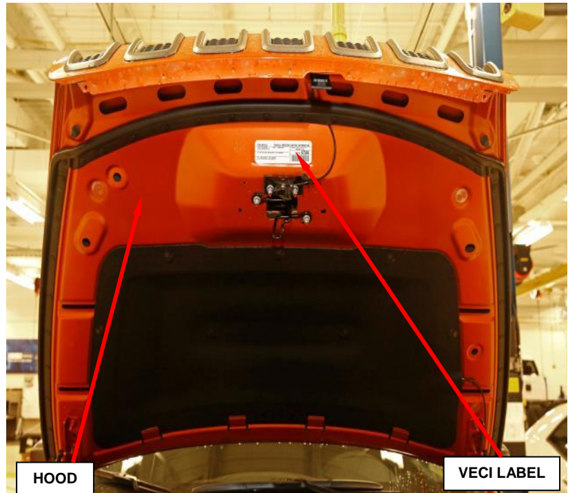
Figure 1 – VECI Label Location