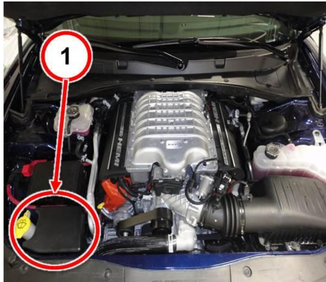
Fig. 1 Underhood View