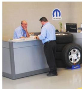
Ask if the customer would like alternate transportation

With your partnership, programs such as the CTP will contribute to creating a great experience for our customers and foster long term loyalty to your dealership and our Brands.