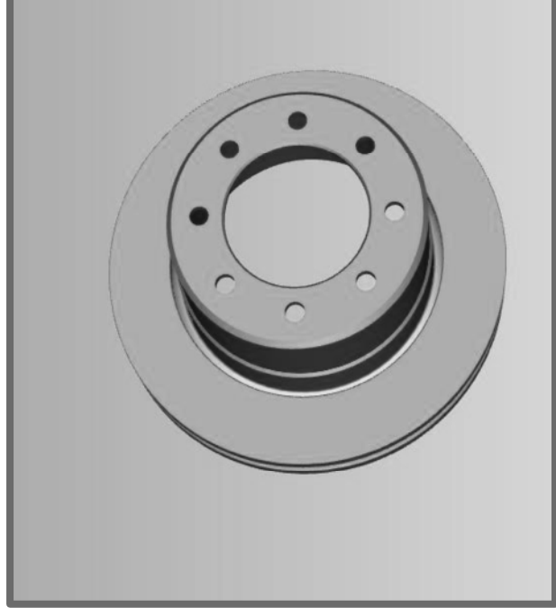
Suspect Part Identification

Suspect part does not have threaded holes.