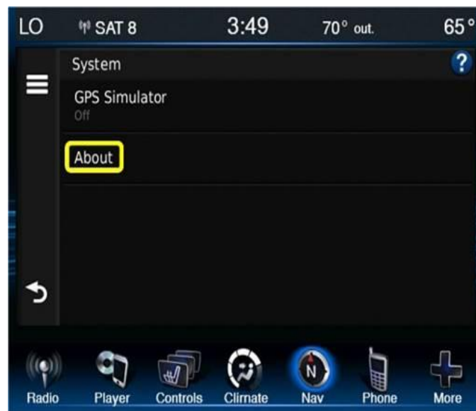
Fig. 5 About Icon

19. Press the About screen icon, See (Fig. 5), and record the software version.