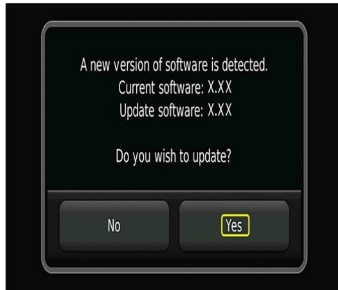
Fig. 7 Garmin Software Needs Updating