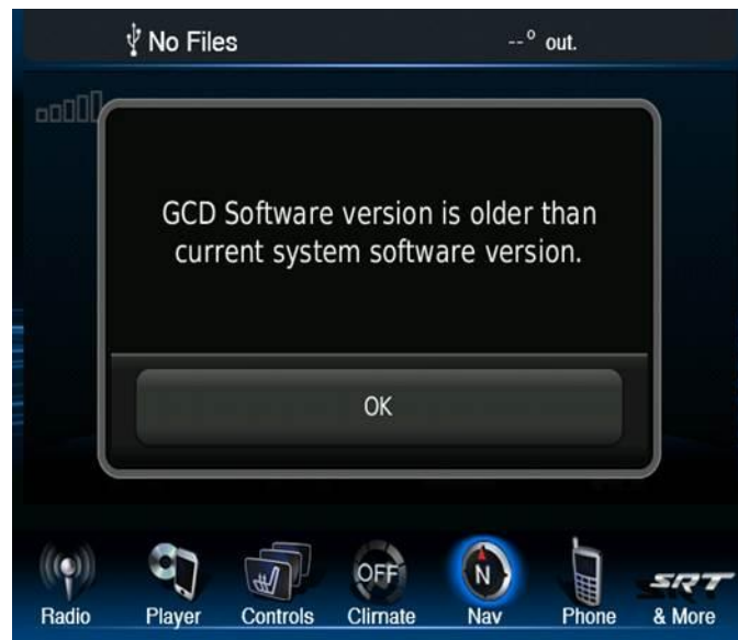
Fig. 6 Garmin Software Already Updated