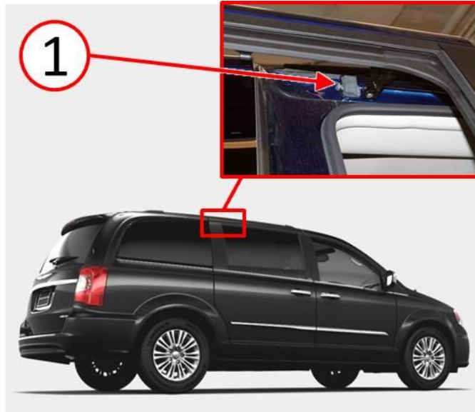
Fig. 1 Remove Bumper