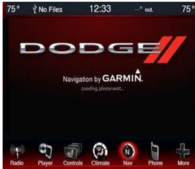
Fig. 1 System Loading Screen