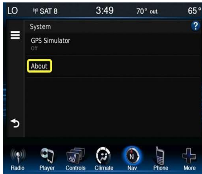
Fig. 7 About Icon

20. Press the About screen icon, see (Fig. 7), and record the software version.