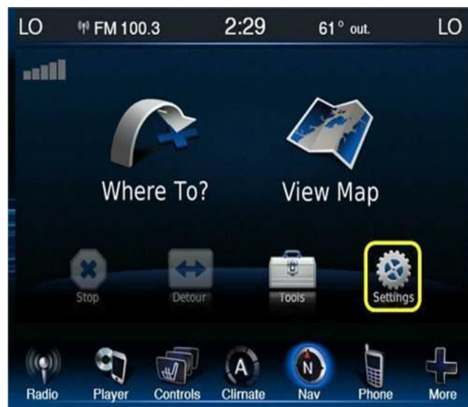
Fig. 5 Settings Icon