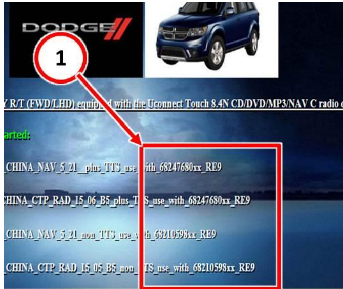
Fig. 3 Uconnect Main Portal Screen