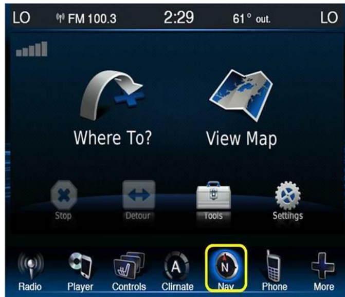
Fig. 11 Update Complete

27. When the software has completed down loading, the screen will change to the Garmin main screen, see (Fig. 11)