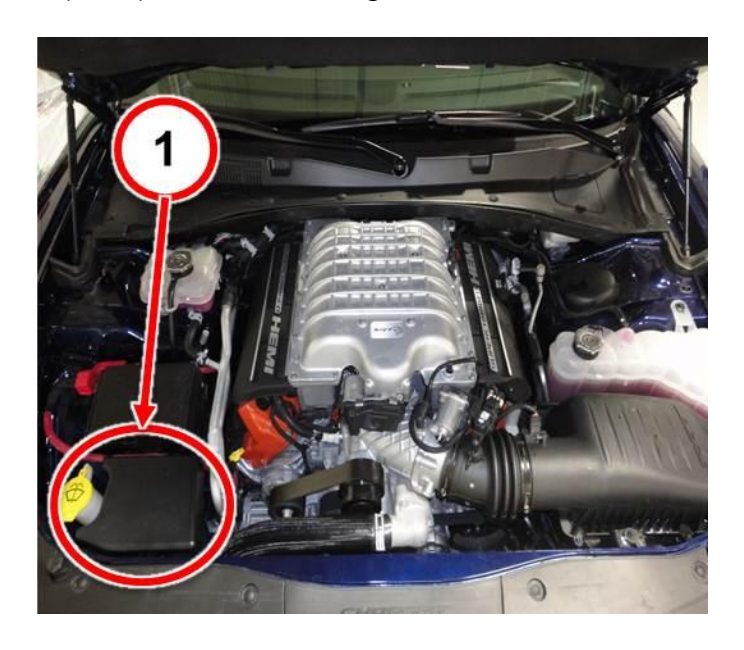
Fig. 1 Underhood View

2. If equipped, remove the impact cover located above the ABS module, See (Fig. 1), by removing the 2 push pin retainers located between the cover and the Power Distribution Center (PDC) and then sliding the cover rearward.