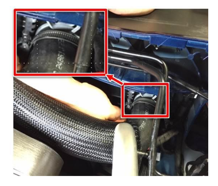
Fig. 2 Radiator Hose Clamp Orientation