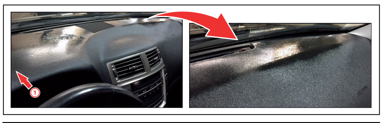
Figure 1. Examples of Sticky/Shiny Condition