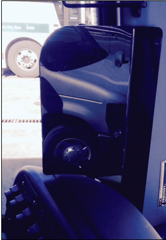
Figure 3 :Wrong