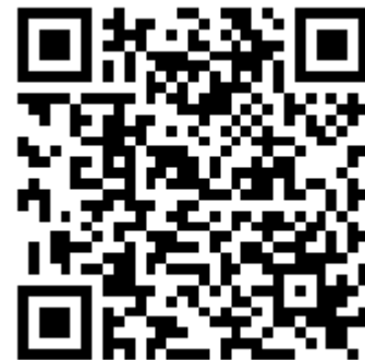
Figure 3. QR code for viewing the video with a QR code reader on phones and tablets. Alternatively, the video can be accessed through computer internet browsers at the link provided in this bulletin.

Tip: For an example of the clicking noise made during normal operation, view the video at: https://audi-external.kzoplatform.com:443/swf/player/315 (Figure 3).