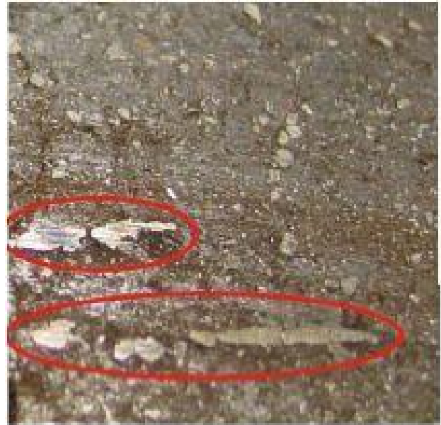
Figure 1. Metallic deposits.