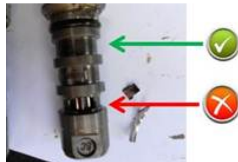
Figure 1. Two top filters are okay, bottom filter is missing.