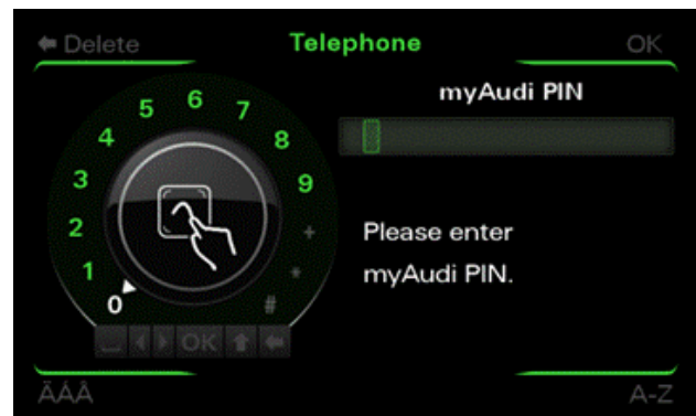
Figure 2. myAudi PIN entry