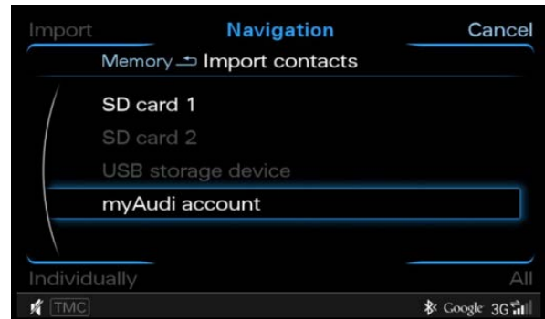
Figure 3. Importing contacts from the myAudi account.