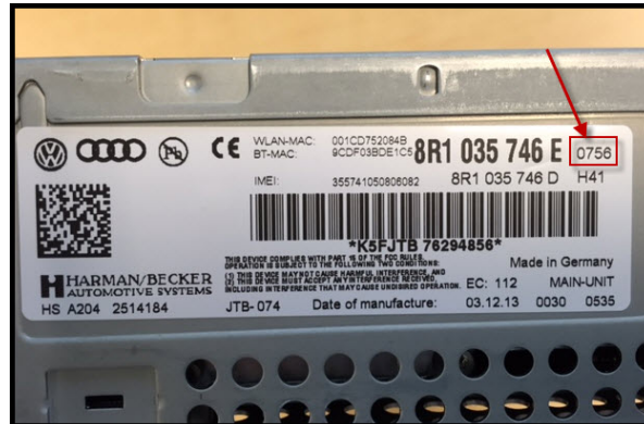
Figure 3. Main unit part label.