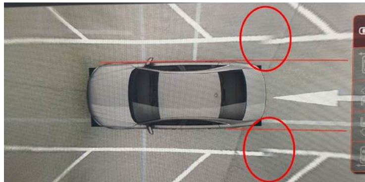
Figure 2. Example of distortion.