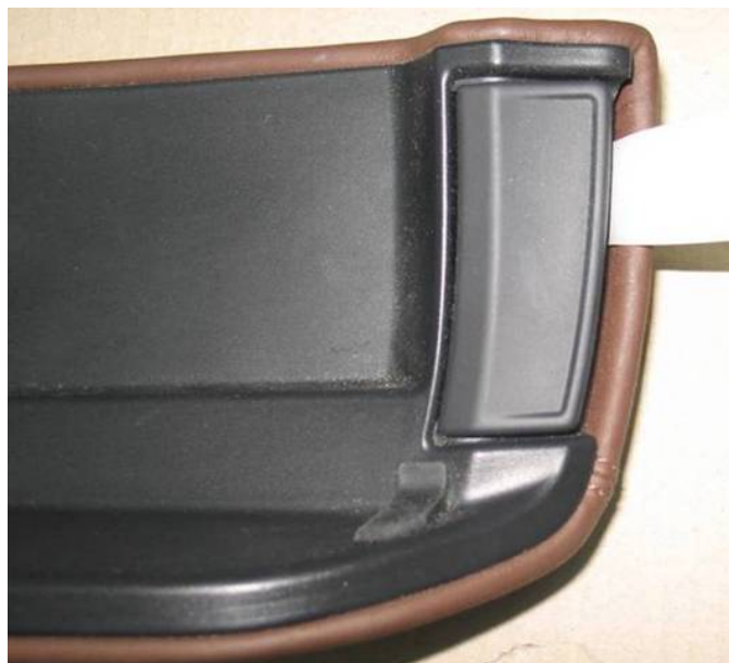
Figure 1. Use a trim tool to separate the top of the armrest from the lower portion.