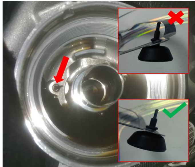
Figure 1. Correct and incorrect position of the oil drain plug.

If the condition persists, contact the Technical Assistance Center (TAC).