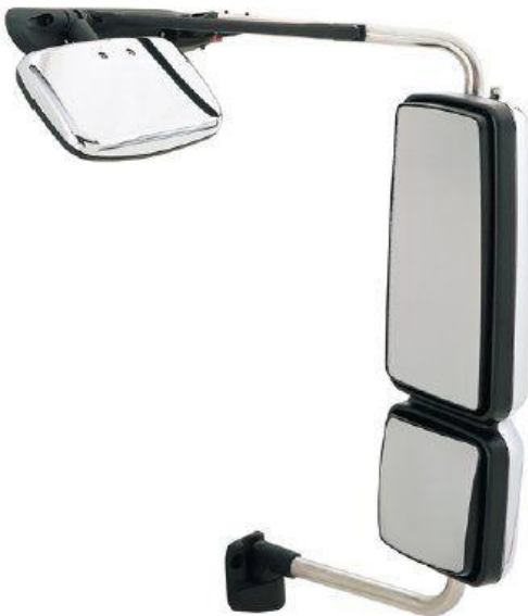
Figure 2: Premium Series Mirror

Click here for Service and Parts Manual or visit http://www.lang-mekra.com/servicemanuals.html