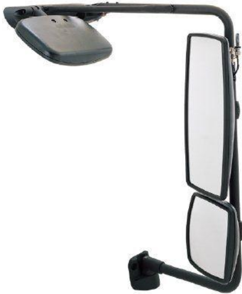
Figure 1: Standard Series Mirror

Click here for Service and Parts Manual or visit http://www.lang-mekra.com/servicemanuals.html