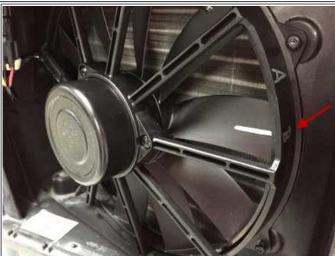
Figure 3: Mark "B" as the second location