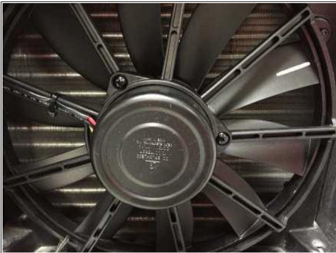
Figure 1: Location 1 (Home Location)