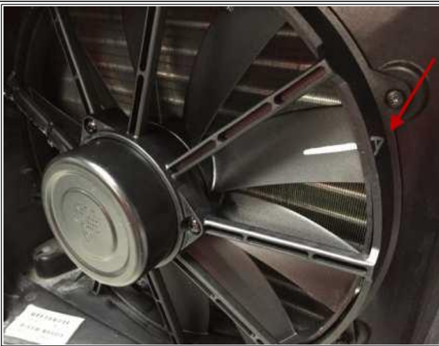
Figure #2: Mark "A" as the first location