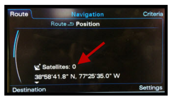
Figure 1. No satellite reception.