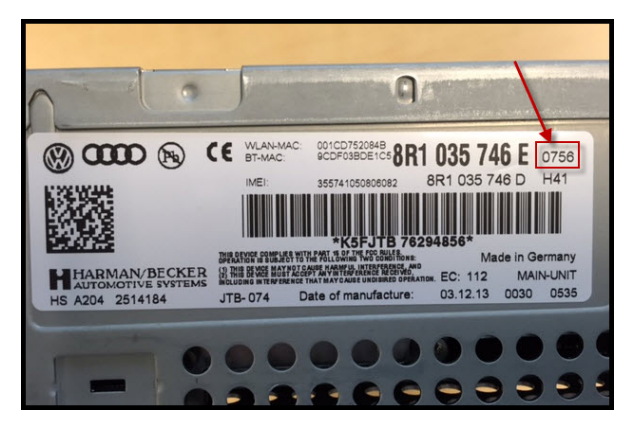
Figure 3. Main unit part label.

Check the label (Figure 3) on the side of the new part to verify that it contains software at level 0901 or higher. Install the replacement MMI main unit (information electronics control module 1, J794 (address word 5F)).