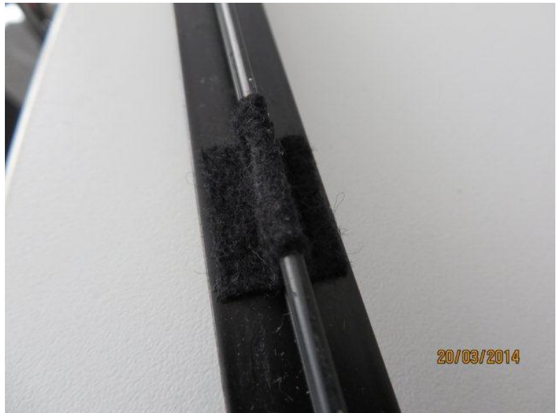
Figure 3: Fleece tape section applied.