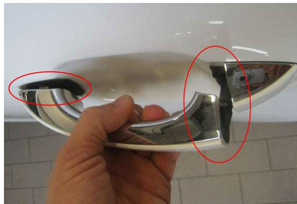
Figure 1. Clean handle in circled areas.