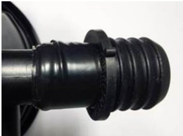
Figure 4. Vinyl layer supporting grommet.