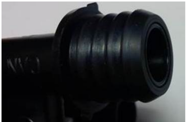
Figure 2. Align grommet and sensor outer edges.