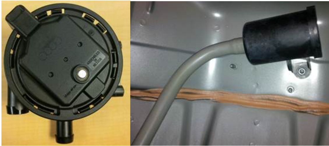
Figure 1. NVLD pressure sensor (left) and NVLD filter (right).