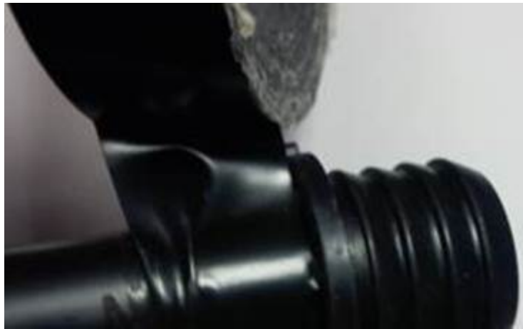
Figure 3. Wrapping vinyl tape behind the grommet.