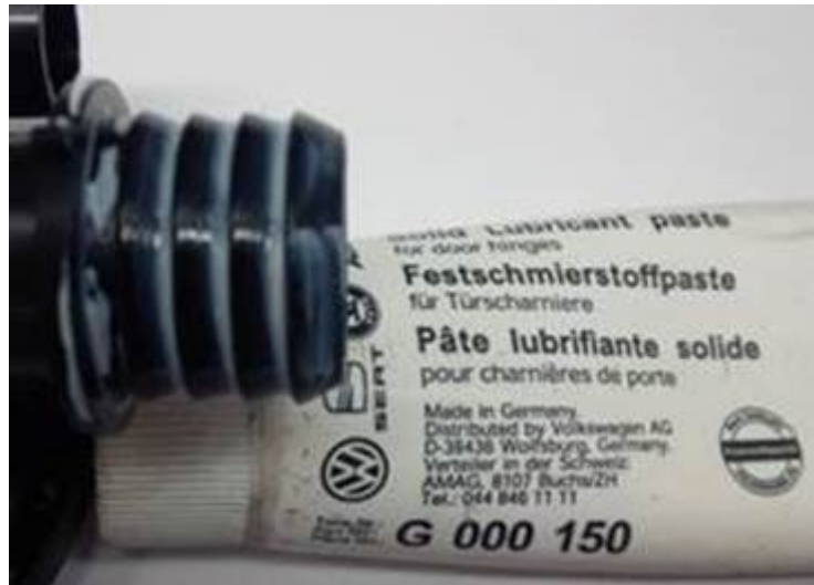
Figure 5. Grease film on outer surface of grommet.