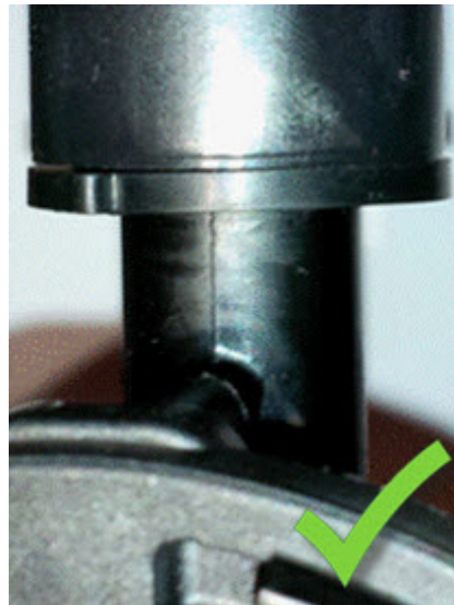
Figure 6. Correctly-installed sensor and grommet.