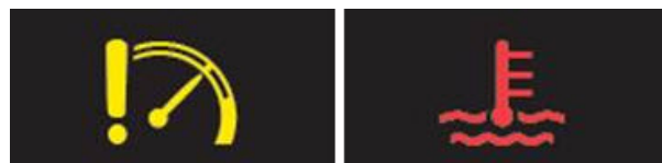
Figure 1. Engine speed governing light (left) and red coolant light (right).