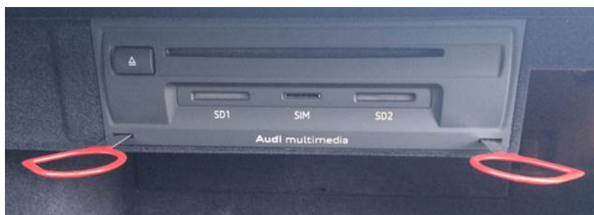
Figure 2. Remove the J794 module.