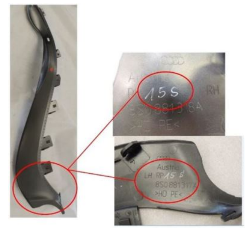
Figure 4. Location of the 15S version marking on the trim.

The latest improved version of the trim is marked on the inside of the trim with "15S" (Figure 4).