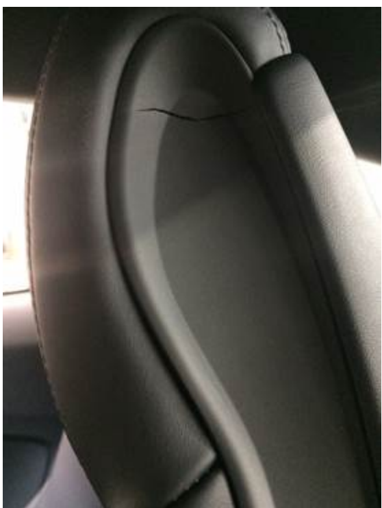
Figure 3. Front seat side trim cracked.