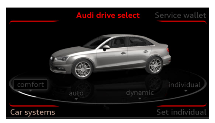
Figure 1. Audi drive select functions unavailable and greyed-out.