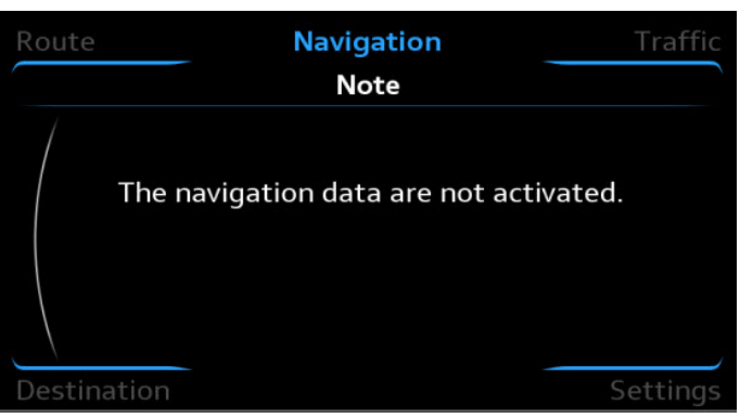
Figure 2. Navigation not activated message.