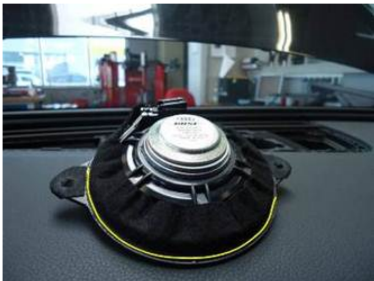
Figure 3. Area of speaker where felt tape is to be applied.