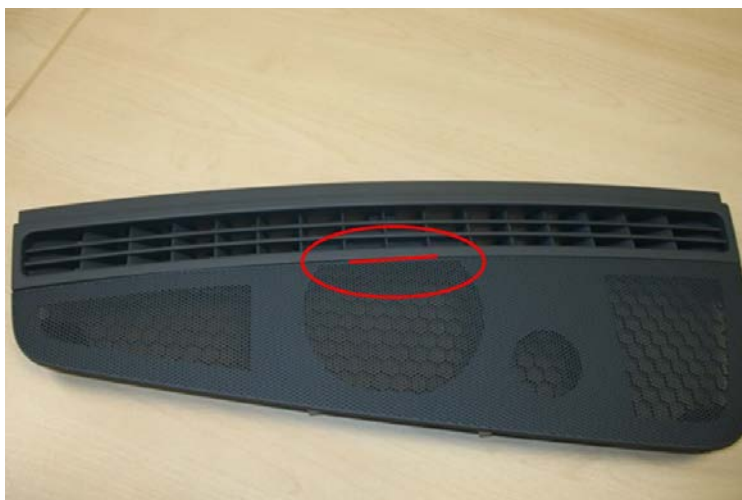
Figure 1. The affected area of the speaker grille, circled in red.

Because there is no attachment to the trim carrier in the speaker cut-out, this area is the likely source of the vibration (Figure 1).