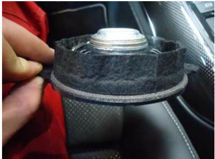
Figure 4. Center speaker with felt tape applied.