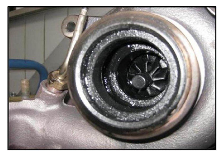
Figure 1 (broken turbocharger shaft, engine oil ingress on exhaust side)

• If turbocharger is found to be damaged, the DPF must be reattached at the turbocharger before proceeding to the following steps: