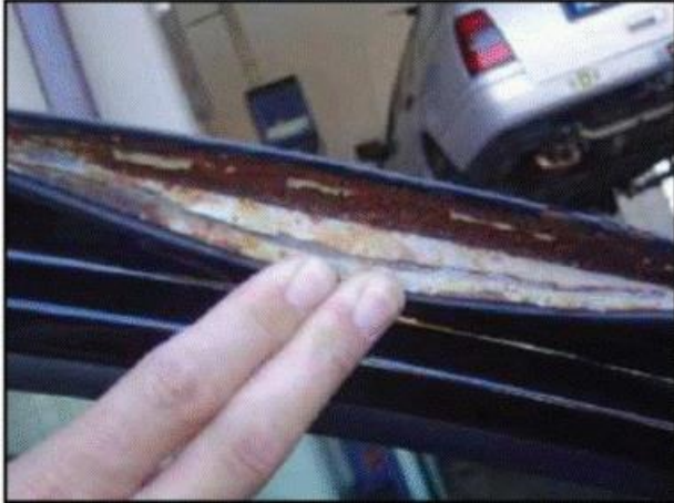
Figure 3 (Paint Group 03) – Door Replacement