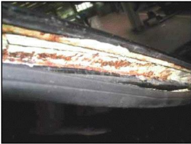
Figure 2 (Paint Group 01/02) – Door Repair