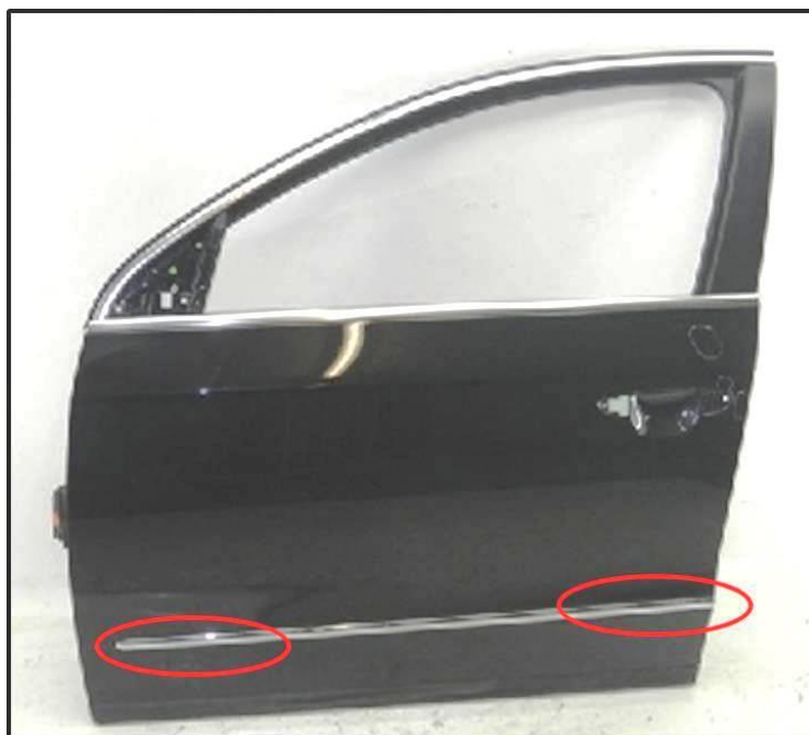
Figure 1 (the red ellipses show the area which can be affected by the corrosion)