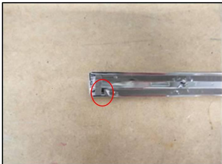
Figure 2 (the red circle shows the opening of the incomplete bonding)

Because of incomplete bonding of the trim strip (Figure 2, red circle) water can get between trim strip and door. Because of water ingress, corrosion is possible in the area of the guide holes (Figure 1, red circles).