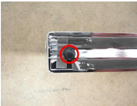
Figure 5 (rear trim strip area)