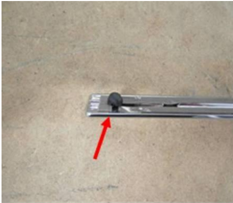
Figure 6 (rear trim strip area)