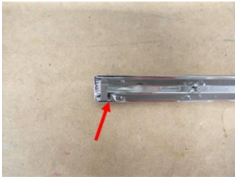
Figure 3 (rear end of a trim strip)