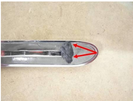
Figure 7 (front trim strip area)