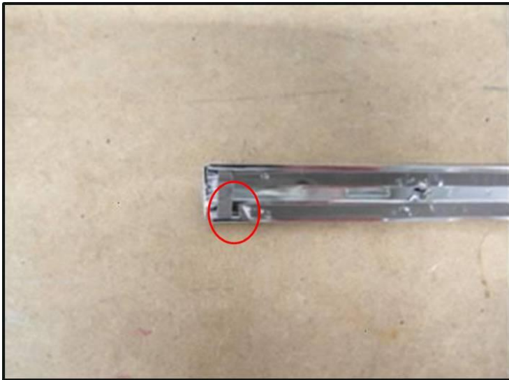
Figure 2 (the red circle shows the opening of the incomplete bonding)

Because of incomplete bonding of the trim strip (Figure 2, red circle) water can get between trim strip and door. Because of water ingress, corrosion is possible in the area of the guide holes (Figure 1, red circles).