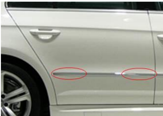
Figure 1 (the red ellipses show the area which can be affected by the corrosion)