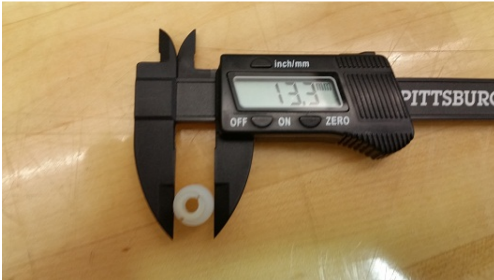
Figure 3 (Acceptable diameter after adding adhesive strip)