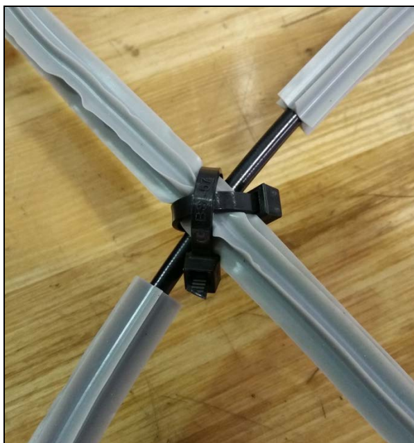
Figure 3: Crisscross 2 zip-ties to secure regulator cables if c-clip is missing. Do not overtighten zip-ties.