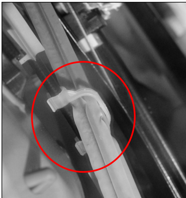
Figure 2: Proper installation of regulator cable c-clip.