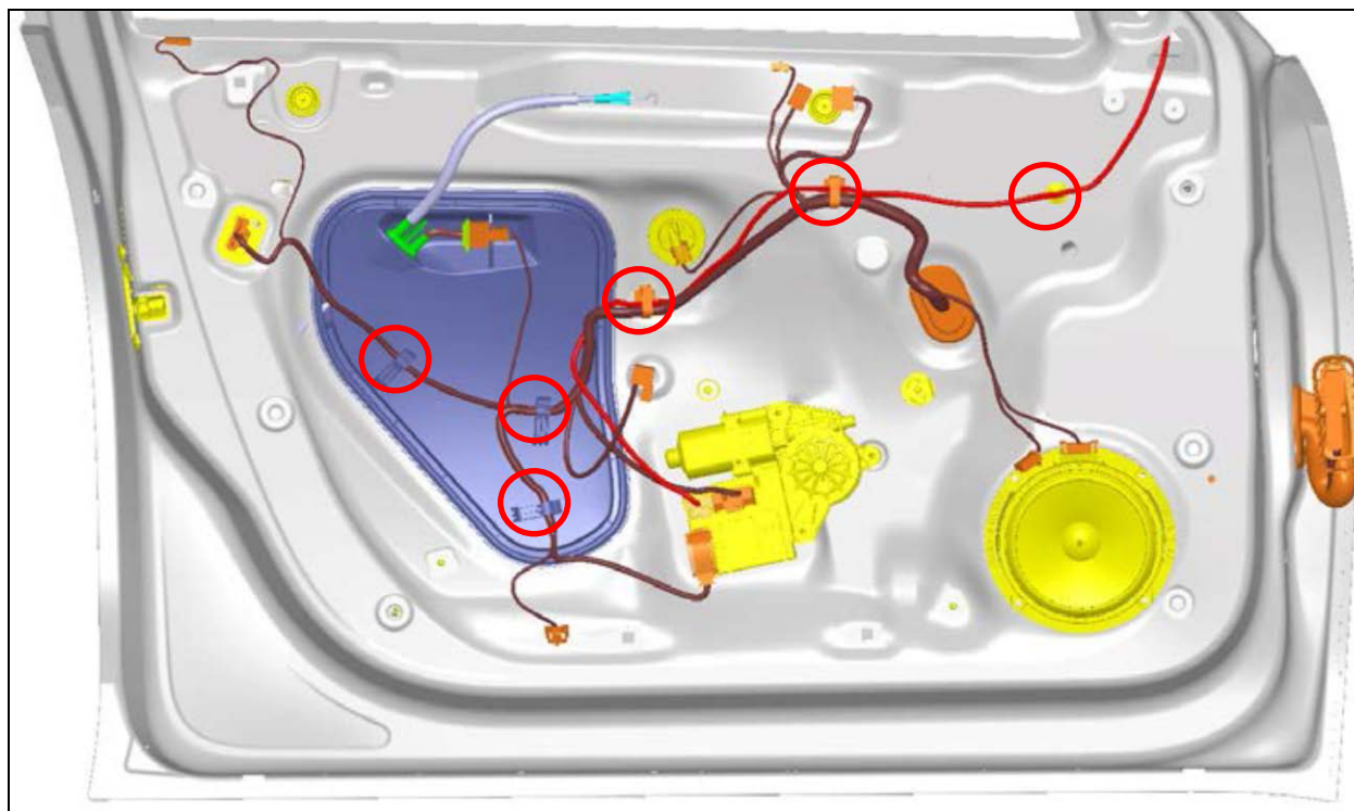
Figure 4: Location of door wiring harness retaining clips (red circles).