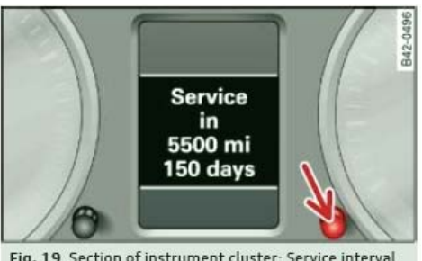
Fig. 19 Section of instrument cluster: Service interval display

Pull the knob until the display Oil change in ----- mi (km)--- days appears. If the RESET button is not pulled within 5 seconds, the display reset mode closes.