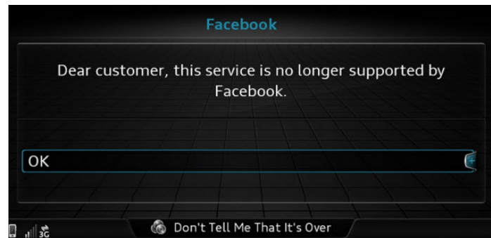
Figure 1. Message in MMI.