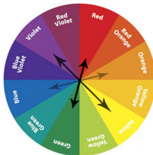
Figure 2. Complementary color wheel.

In certain lighting conditions, the system responds to vibrant nearby colors (from the vehicle or other objects) by automatically adding a complementary color (Figure 2) to rebalance toward white, which can lead to color deviations. For example, a red object can cause the system to add a green hue. The strength of the added color depends on the brightness of the object and the ambient light.