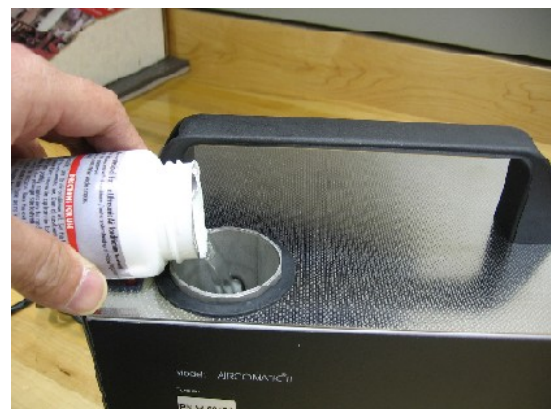
Figure 2. Pouring the treatment into the filling chamber.