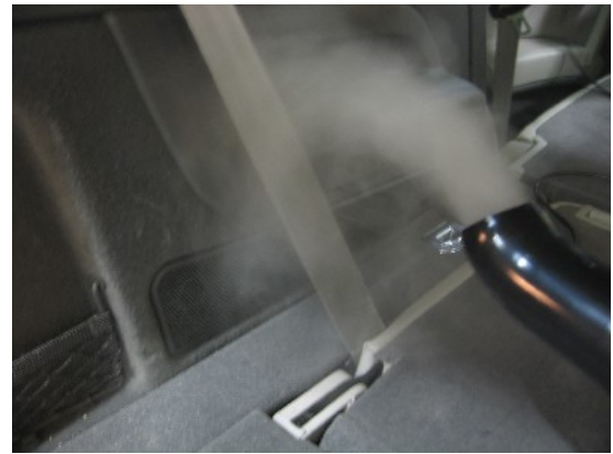
Figure 5. Correct positioning of the outlet tube on a Q7.