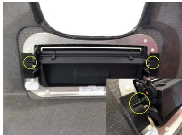
Figure 3. Location of the two screws that retain the media access door.