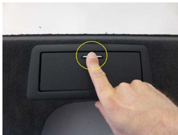
Figure 1. Pressing the center of the release button allows the access door to open more easily.