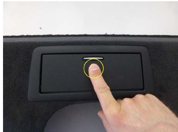
Figure 2. Applying force more centrally allows the access door to close more easily and consistently.