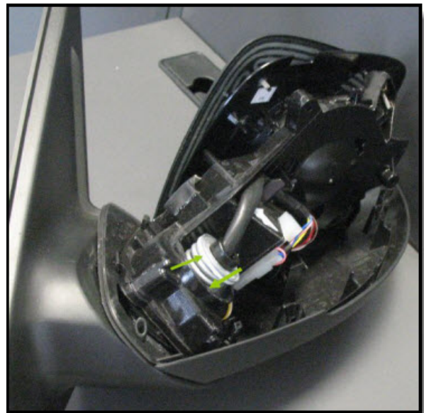
Figure 1. Driver Side view mirror with cap removed.