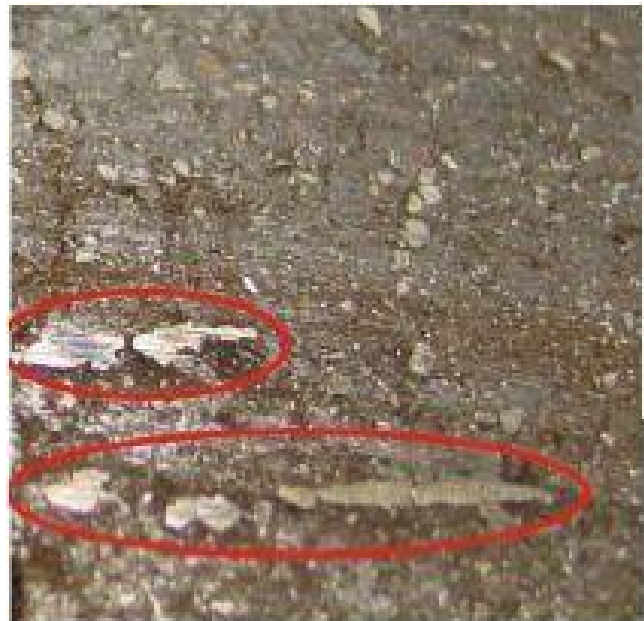
Figure 1. Metallic deposits.