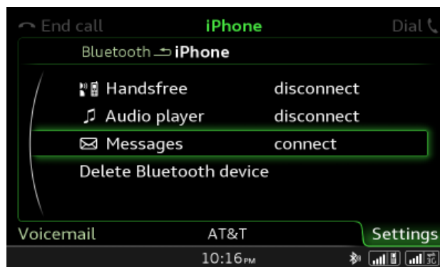
Figure 5. Messages Connect option for MIB1.