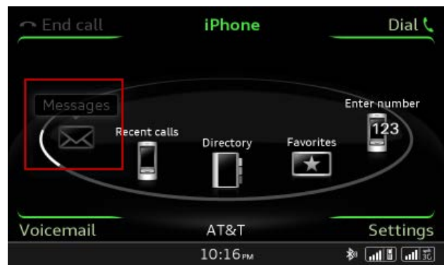
Figure 2. Messages menu greyed out

(With Android phones, the option to allow the MMI to access the phone's text messages appears in a pop-up when the phone is first paired to the vehicle.)