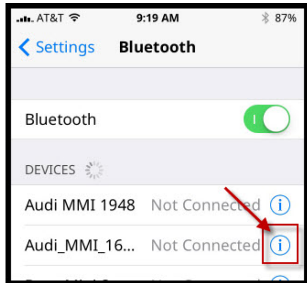
Figure 3. “i” next to the Audi MMI pairing.