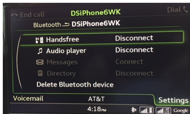
Figure 6. Messages Connect option is greyed-out and not accessible for MIB2.