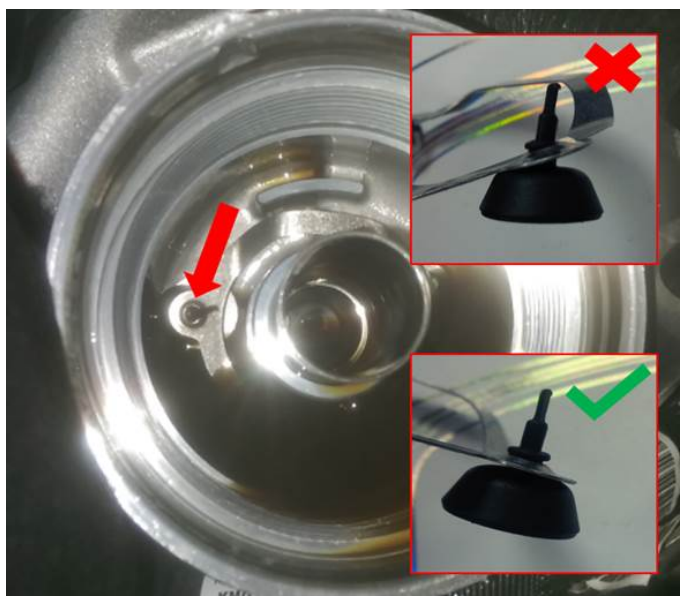
Figure 1. Correct and incorrect position of the oil drain plug.

If the condition persists, contact the Technical Assistance Center (TAC).