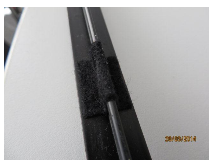
Figure 3: Fleece tape section applied.

3. Apply the sections of fleece tape to the sunroof cover trim frame to each clipping point as shown (Figure 3 and Figure 4).