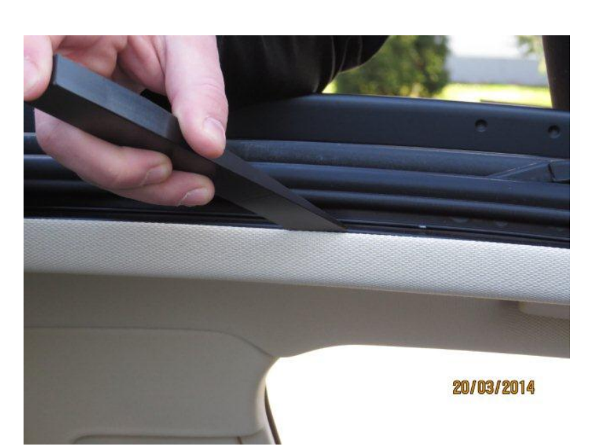
Figure 1: Unclipping the sunroof cover trim frame.