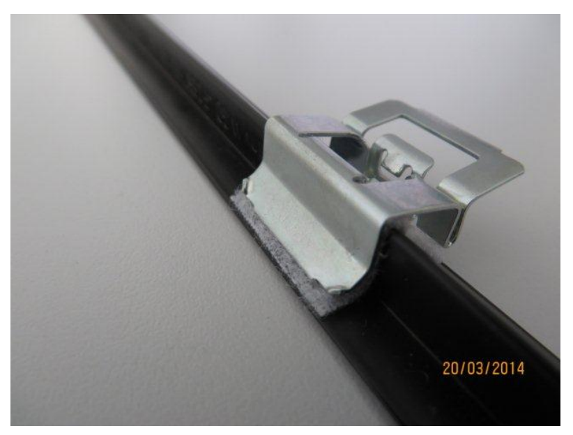
Figure 4: Retaining clip isolated with the fleece tape.