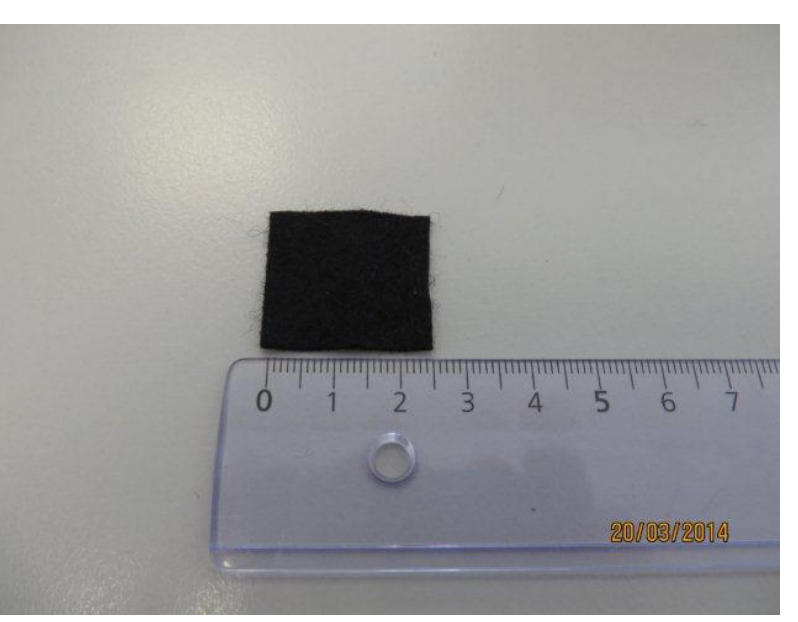
Figure 2: A 25mm section of fleece adhesive tape D 373125A2.