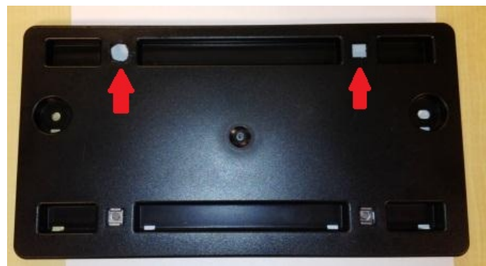
Figure 1. Damaged screw inserts

Damaged warranty parts have been returned to Audi of America with evidence of excessive torque used when installing the screw and/or excessive screw length (Figure 1).