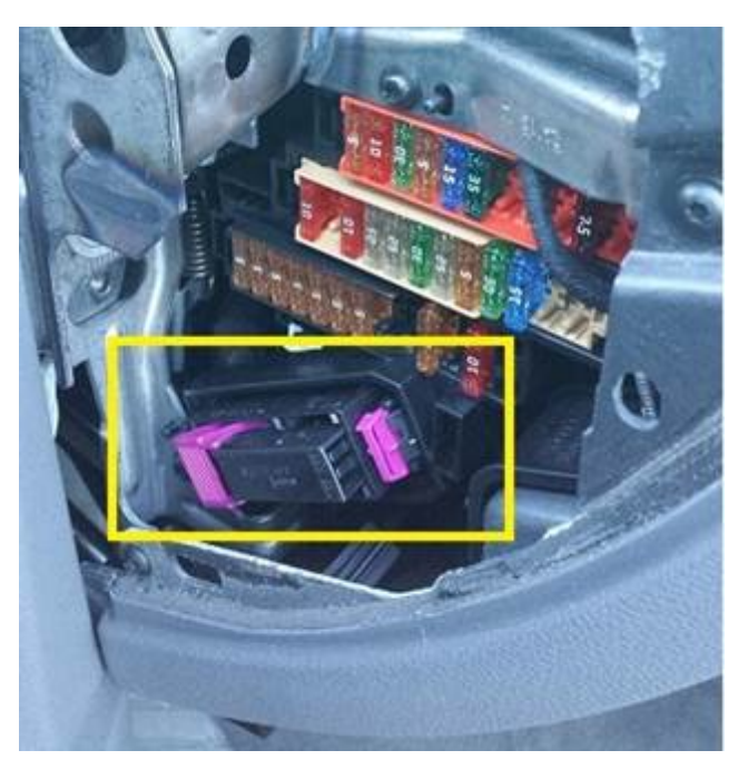
Figure 1. T46a CAN disconnect plug, left dashboard.

Tip: Protect twisted pair with loom and abrasion resistant cloth. Beware of any moving parts behind dash panel that may chafe the wiring overlay.